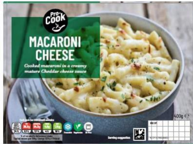
Pro-Cook Macaroni Cheese 400g

Due to a supplier allergen contamination issue, we are recalling the above product as we have been advised they may contain traces of peanuts, which could pose a risk to those consumers who suffer from a peanut allergy. This affects the above product and its use by dates up to and including 29 th October 2024.