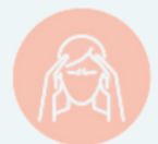
Stress / anxiety