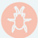
Allergens inc dust mites, mould spores?

Common trigger allergens and irritants include skin infection, sudden changes in temperature, stress, detergents (soap, bubble bath, washing up liquid) fragrance, perfume, fabrics including animal wools and man-made fibres, house dust mite, pets, pollen, mould spores and foods in infants.