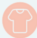
Clothing and fabric