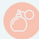
Perfume or fragrance