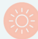
Changes in temperature