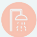
Hot baths or showers