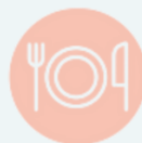
Food and drink